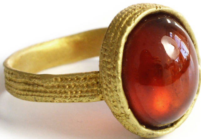
R120G18G Textured garnet ring, 18k yellow gold