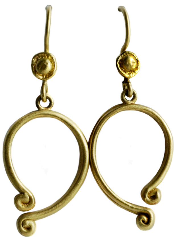
E032G18 Paisley earrings, 18k yellow gold