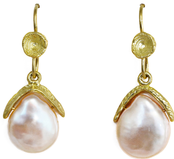
E059G18P Textured gold capped pearl drops, 18k yellow gold