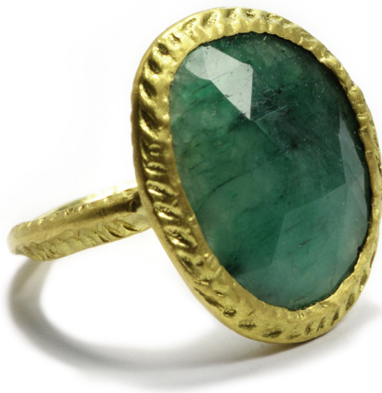
R134G18E Emerald rose cut textured ring, 18k yellow gold