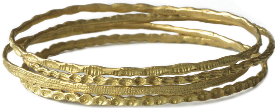
B019G18 B016G18 B018G18 B020G18 Textured bangles, 18k yellow gold