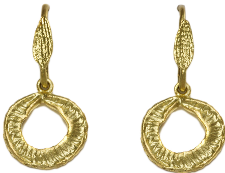
E081G18 Textured circle drops, 18k yellow gold