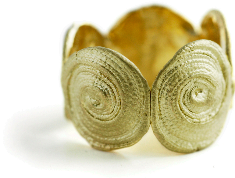
R067G18 Five spiral ring, 18k yellow gold