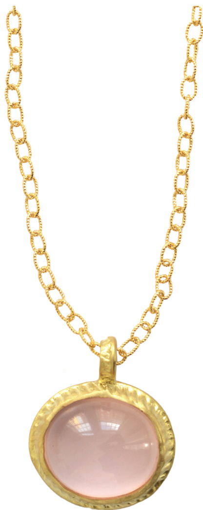
PO32G18Q Rose quartz pendant, 18k yellow gold